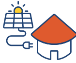
Solar Home Systems (SHS)