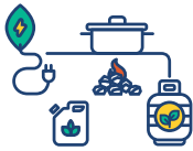
Improved Cooking Solutions

BRILHO is a five-year Programme, 2019 – 2024, with nationwide coverage that will catalyse Mozambique's energy market of Improved Cooking Solutions, Solar Home Systems and Green Mini-grids to provide clean and affordable energy solutions to the off-grid population and businesses. The aim is to stimulate the private sector to focus their efforts, innovative ability and resources to develop and invest in quality and affordable off-grid energy products, systems and services, in order to improve the lives of low income people in Mozambique, through money saving, better well-being and livelihood opportunities, while delivering commercial benefits for the private sector.